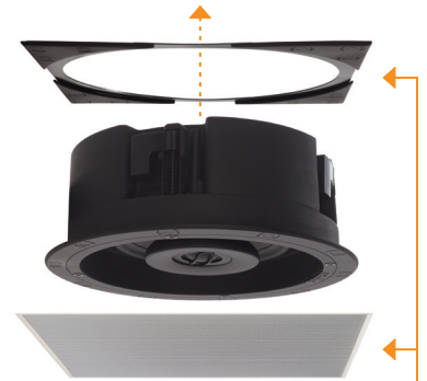
Square Adapter w/ Grille